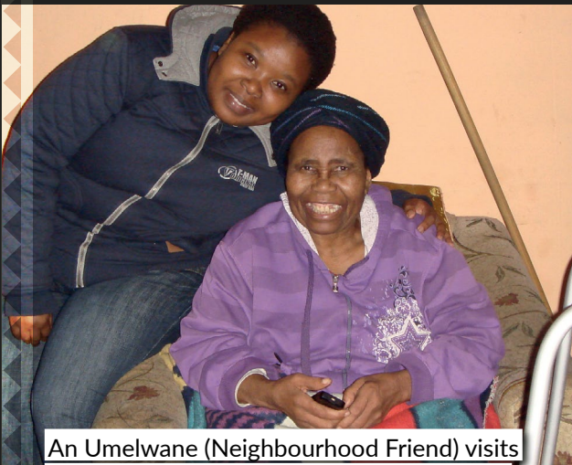
An Umelwane (Neighbourhood Friend) visits a frail senior in her home. We have reached over 700 seniors through the new Umelwane Project.