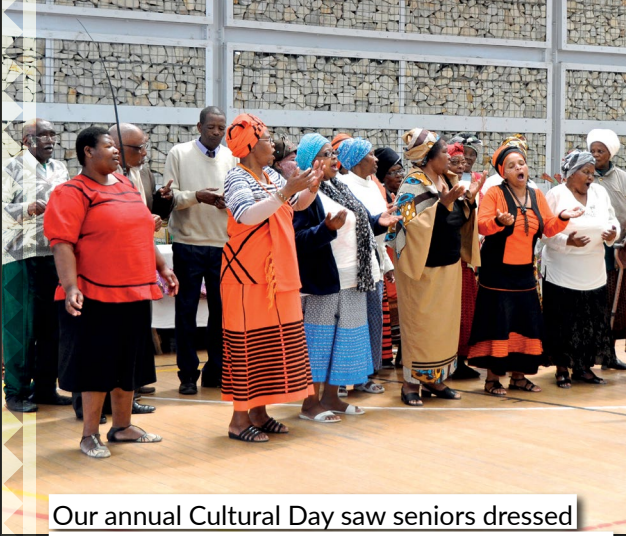
Our annual Cultural Day saw seniors dressed in traditional attire, singing songs and displaying their hand-crafted goods for sale.