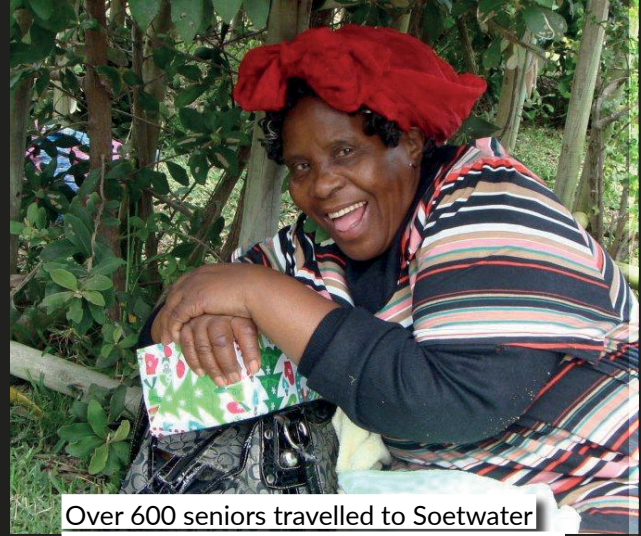
Over 600 seniors travelled to Soetwater for our annual Christmas outing. For some, it was their first trip to the ocean.