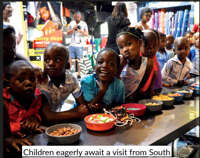
Children eagerly await a visit from South African afropop band Freshlyground at the launch of our first Fuel2Grow campaign.